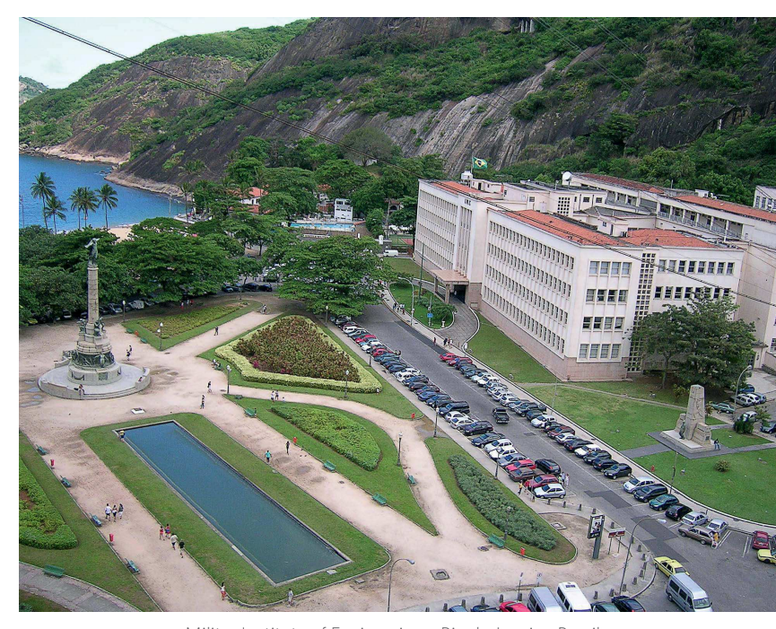
Militar Institute of Engineering - Rio de Janeiro, Brazil.