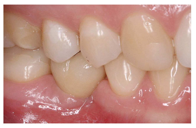
Figure 11 - Final metal and ceramic crown screwed to 1.5 mm high SynOcta abutment (five weeks).