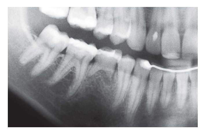
Figure 2 - Radiographic appearance of deciduous tooth and underlying bone.