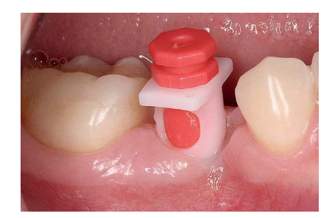
Figure 7 - "Snap-on" impression component installed.