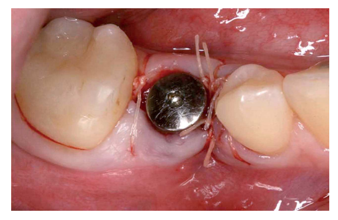
Figure 3 - Dental implant in position. Photograph shows 1.5 mm high cover screw and sutures after deciduous tooth removal and implant installation.