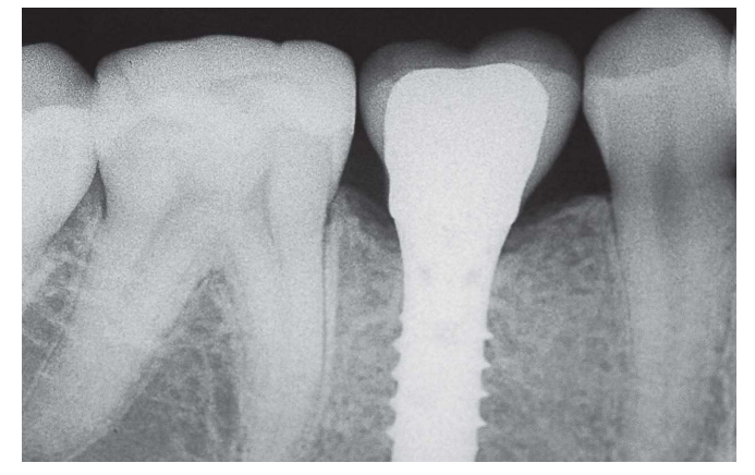
Figure 13 - Radiographic appearance at three years' follow-up.