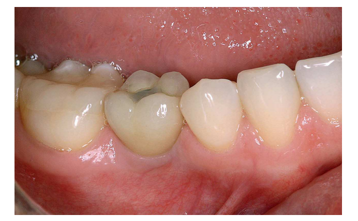
Figure 12 - Clinical aspect at three years' follow-up.