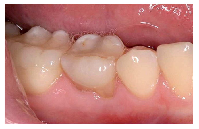
Figure 1 - Clinical aspect of deciduous tooth.