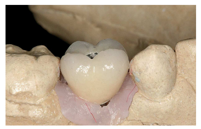
Figure 9 - Final metal and ceramic crown.