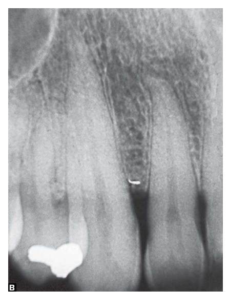
Figure 5 - Initial radiographic aspect of type 2 DM patient. It can be observed mild horizontal bone loss.