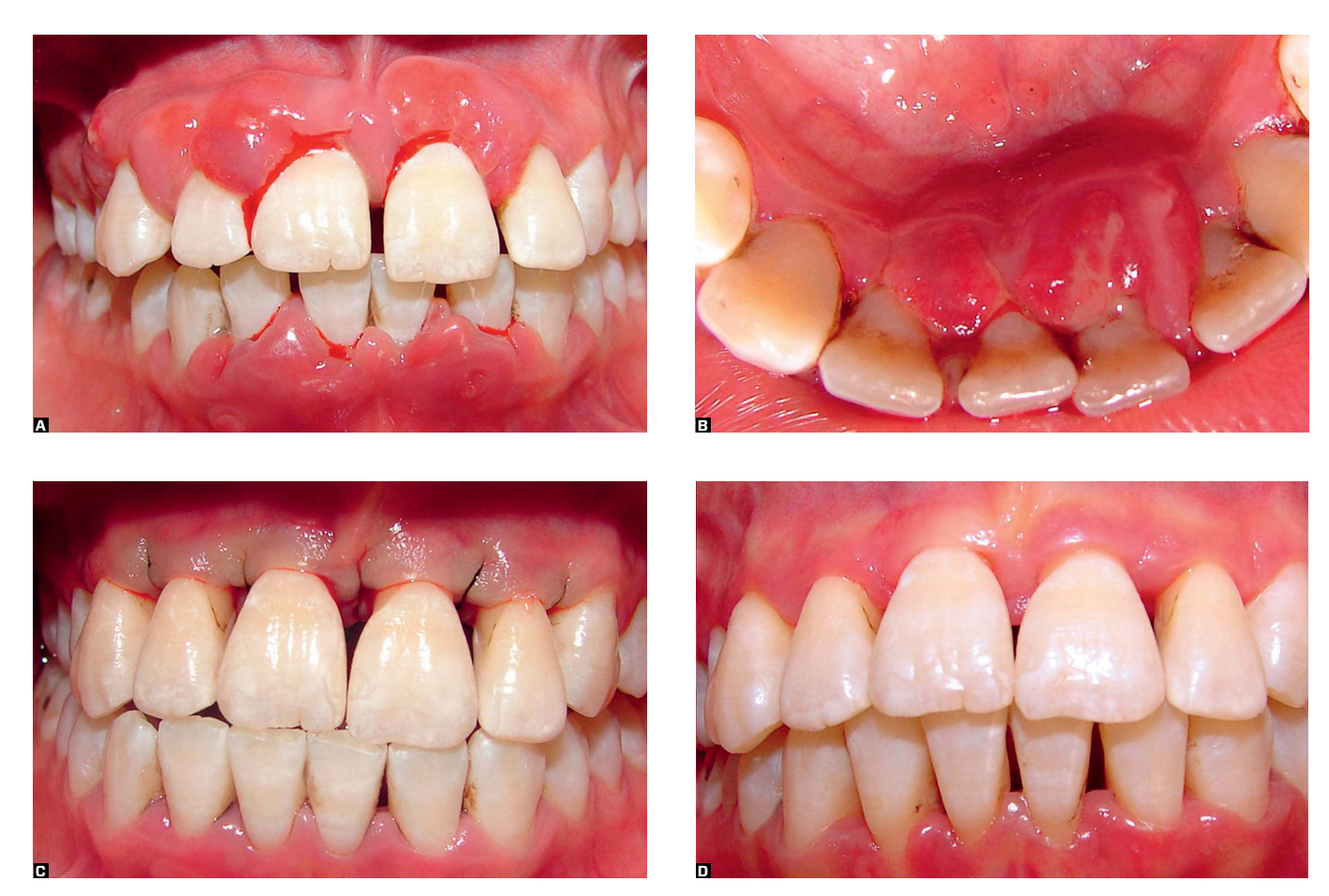
Figure 1 - Images showing clinical aspect of type I diabetes patient. A, B) Initial aspect. It can be observed gingival hyperplasia, pathological dental migration and spontaneous bleeding. Also one can notice the presence of microabscesses in the region of teeth 13, 32 and 42. C) Realization of periodontal surgery with modified Widman flap. D) Clinical aspect one year after conclusion of periodontal therapy of the patient.