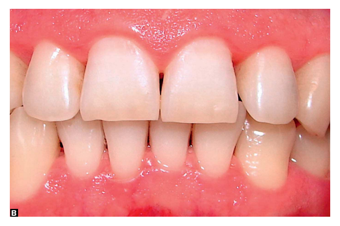
Figure 4 - A ) Clinical aspect of type 2 diabetes patient. It can be observed hyperplasia in the papillae region. B ) Clinical aspect one year after periodontal therapy conclusion of the patient..