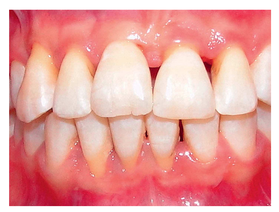
Figure 3 - Clinical aspect of patient with type I DM five years after periodontal therapy.

and oral hygiene education. Occlusal adjustment was performed by selective grinding. Additionally to the mechanical therapy, Amoxicillin 500 mg and metronidazole 400 mg were administered for 10 days.<sup>13</sup> The patient realized mouth rinses with chlorhexidine 0.12% twice daily. Thirty days after the treatment, the inflammatory state was reduced; reduction on the probing depth and clinical attachment gain were observed, as well as reduction on the teeth mobility. Nevertheless, the mandibular anterior teeth still showed deep periodontal pockets, being necessary a surgical approach to treat them. It was also performed modified Widman flap surgery (Fig 1C). Proservation and reevaluation of treatment were performed after 2, 4, 6 and 12 months aiming to observe the stability of the treatment and evaluate the necessity or not of a new intervention. One year after the initial therapy, there was no inflammation and the teeth naturally migrate to them proper position (Fig 1D). The Gingival Index and the Visible Plague Index were approximately 15%, which denotes