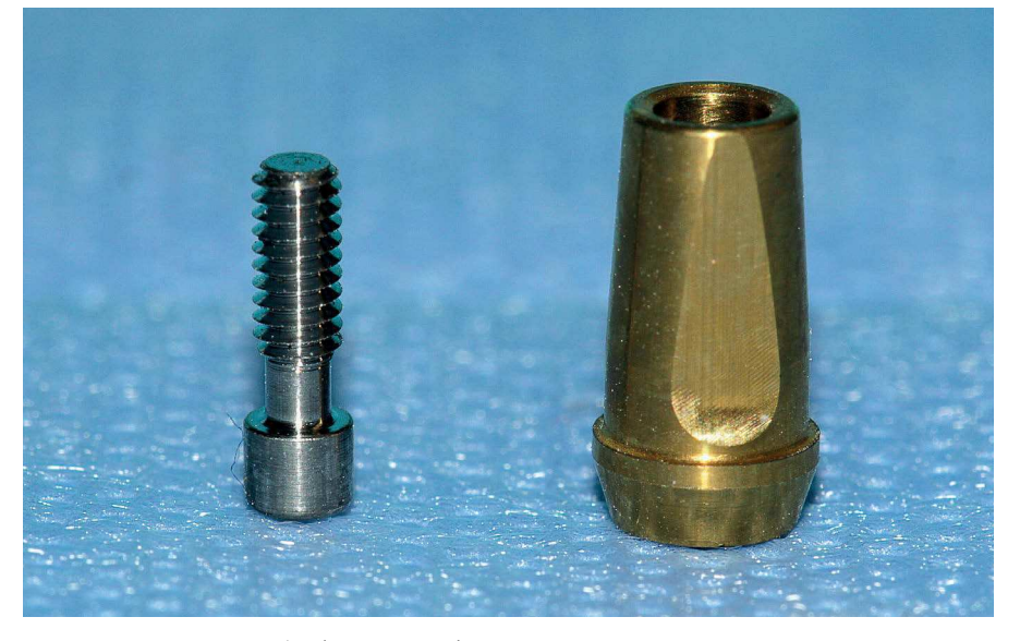
Figure 1 - EC RP 2.00 Pilar (Bionnovation).

Applying the Student's t test it was compared the average of the control and experimental groups. Through the statistical test applied, it was found that there is no statistically significant difference (p = 0.353) between the control and experimental groups. It was considered the significance level of 5%, or p M 0.05 (Table 5).