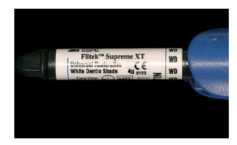
Figure 8 - Filtek Supreme XT (3M ESPE) Photopolymerizable composite resin.