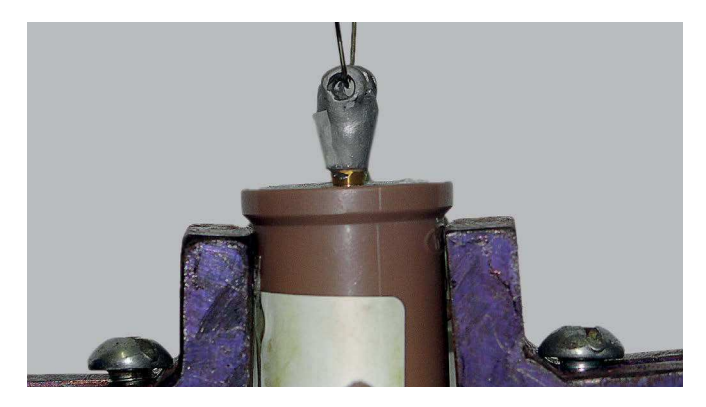
Figure 10 - Approximate view of the specimen positioned in the machine EMIC for testing.