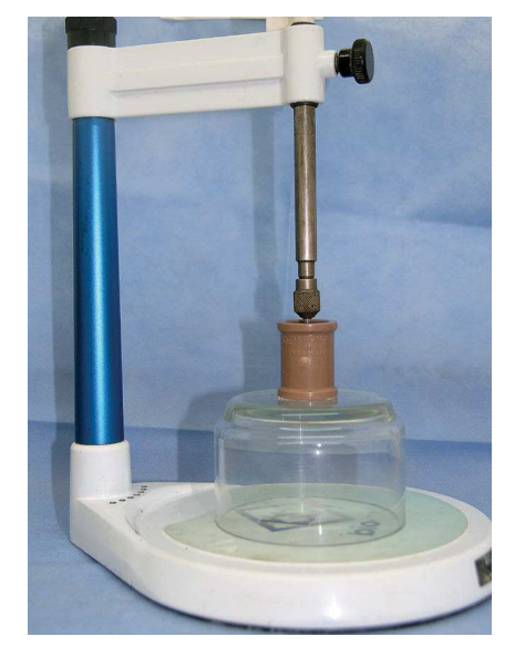
Figure 2 - Implant analog positioned with the aid of a delineator in the PVC pipe.