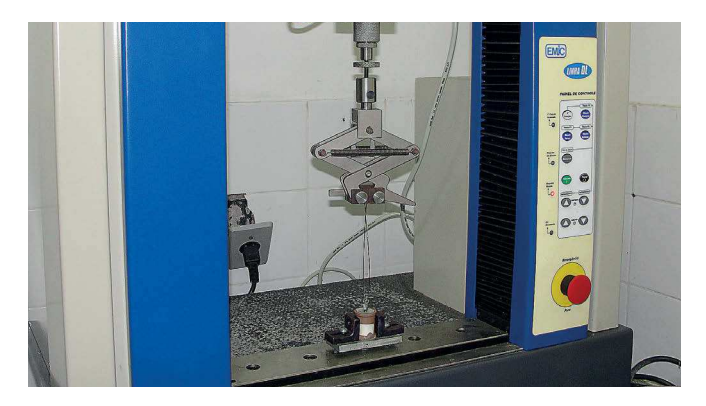
Figure 9 - EMIC machine with the specimen positioned for testing.