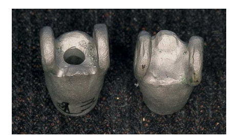
Figure 3 - Full metal crowns for cemented prosthesis on implant.