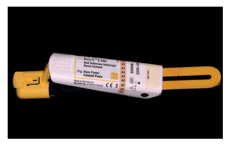
Figure 6 - RelyX U100 resin cement.