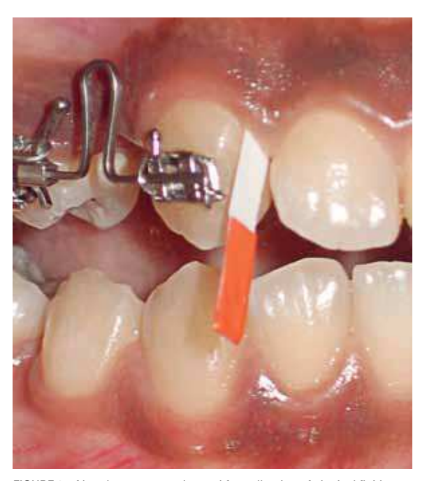
FIGURE 3 - Absorbent paper strip used for collection of gingival fluid.