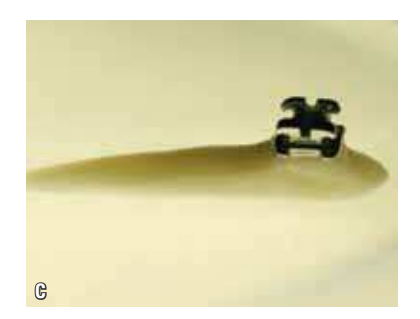
FIGURE 1 - A) Abrasion of palatal surface. B) Bracket bonded to an area bounded by adhesive tape. C) Tooth fixed in agar without contact with