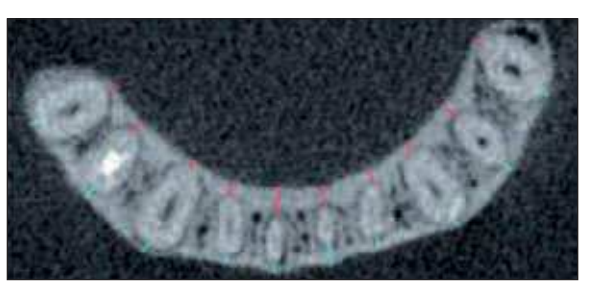
FIGURE 3 - Buccal and lingual bone plate thickness measurements in the axial section of one specimen (0.2-mm voxel).