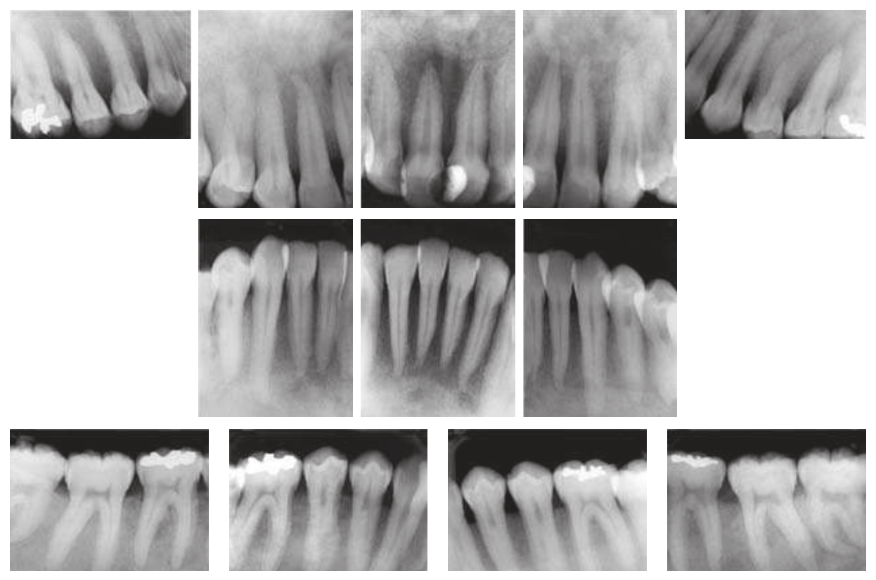
FIGURE 2 - Patient with hyperparathyroidism secondary to renal insufficiency and who underwent hemodialysis for many months. The severity of systemic conditions and their long duration led to involvement of maxillary and severe changes of trabecular bone. The lamina dura was not sufficiently organized to be visible using imaging studies; root structures were preserved and there were no resorptions.

of hereditary involvement or specific genetic changes, the patient should be referred to a geneticist for a careful evaluation and identification of the problem.