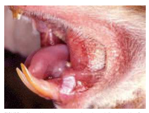
FIGURE 1 - Normal lateral tongue margin and mouth floor in golden Syrian hamsters.

Using the same experimental model, Camargo<sup>5</sup> was mentored, as part of a PhD Program, to test once more the carcinogenic effect of 27% hydrogen peroxide and a specific whitening product containing 10% carbamide peroxide. At the same time, the effects of toothpastes with hydrogen peroxide in their composition were investigated.