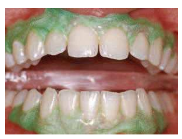
FIGURE 4 - Protective resin dam applied to cervical region; it drastically reduces or prevents contact of whitening product with gingival mucosa and cementoenamel junction.

cer promoting effects of tooth whitening products: Are the risks greater when tooth whitening is applied at home and prepared by the patient with or without professional supervision?