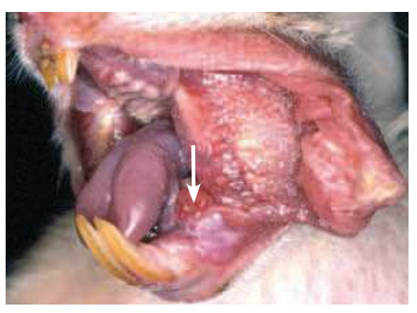
FIGURE 2 - DMBA-induced squamous cell carcinoma in lateral tongue margin and floor of the mouth of golden Syrian hamster after drug application on alternate days for 22 weeks.