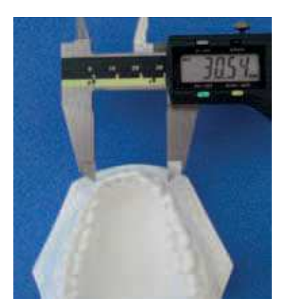
FIGURE 6 - IC WR distance at the respective WR points.