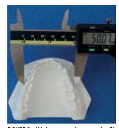
FIGURE 5 - IM distance at the respective FA points.