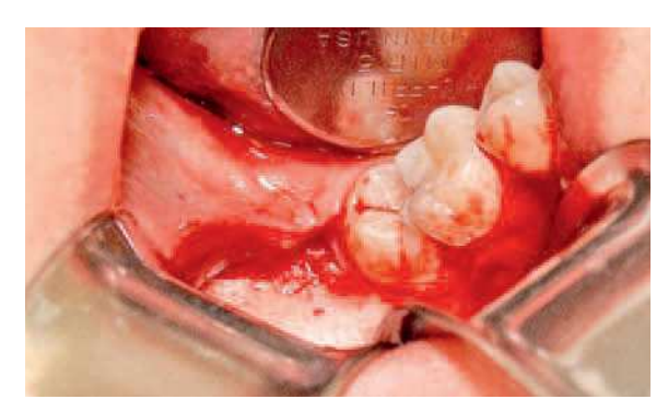
FIGURE 2 - Surgical exposure of the retromolar region/mandibular ramus for miniplate fixation.