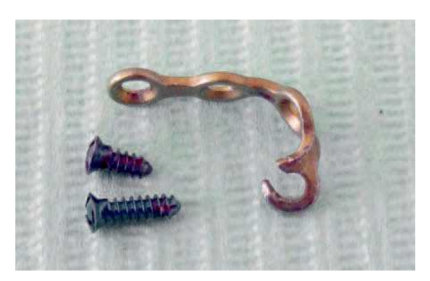
FIGURE 7 - Miniplate and screws surgically removed after 3-months treatment.