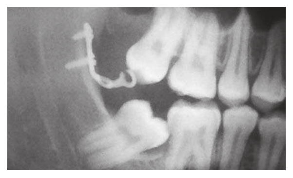
FIGURE 4 - Radiograph obtained immediately after miniplate fixation and before orthodontic movement was initiated.

orthodontic force applied. Three months later, when the tooth had already reached the ideal position (Fig 6), a surgical flap similar to the one used in the first intervention was raised, also under local anesthesia (Fig 7), to remove the miniplate. Total treatment time was three months (Fig 8).