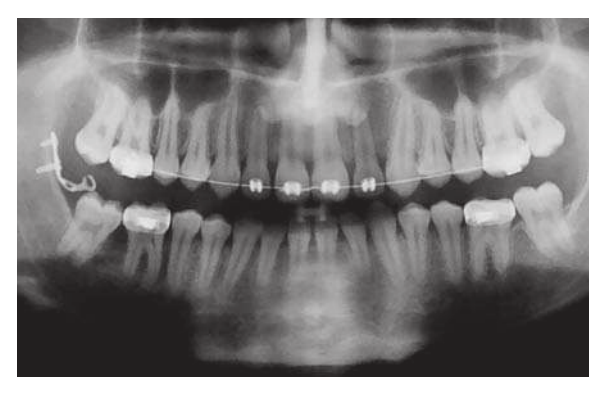
FIGURE 8 - Panoramic radiograph shows tooth 47 in correct position after 3-months treatment.