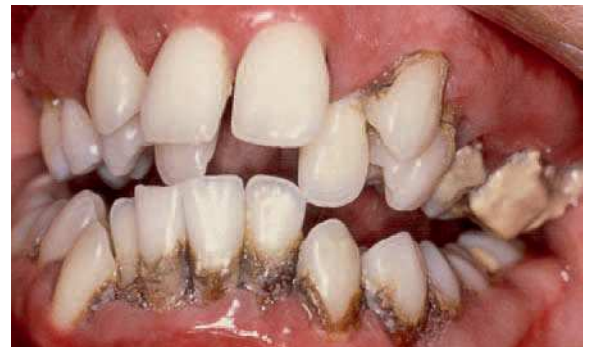
FIGURE 5 - Malpositioned teeth in a patient with periodontitis.