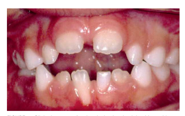
FIGURE 1 - Clinical aspect of malocclusion in mixed dentition, with emphasis on tooth 41 proclined and with gingival recession.

All types of tooth malposition, such as diastemas, crowding, rotated teeth, incisor proclination and mandibular molar tipping, may result in early tooth loss due to the formation of periodontal pockets on the mesial surface of the tooth involved, because the bone crest tends to follow the cementoenamel junction. 15 When any type of malposition is diagnosed, teeth should be aligned to redirect occlusal forces that act along the tooth axis and are harmoniously distributed and to rule out occlusal trauma, which may affect periodontal health. 15,20 According to Freitas et al, 10 mandibular second molar movement enables easier oral hygiene in the mesial re-