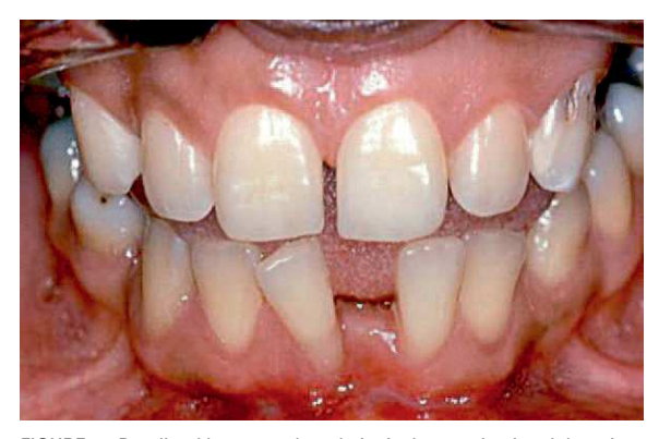
FIGURE 4 - Proclined lower tooth and gingival recession in adult patient with gingivitis and periodontitis.