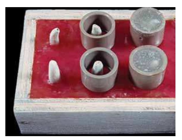
FIGURE 1 - Steps taken to insert bovine teeth in PVC tube.

In the groups using Transbond XT, bonding was light cured for 40 seconds, i.e., 10 seconds on