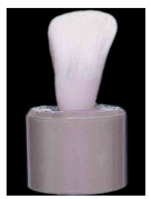
FIGURE 2 - Bovine tooth inserted in PVC tube.

each surface (mesial, distal, incisal and gingival) as close as possible to the base of the bracket with a halogen light unit XL 2500 (3M/ESPE, St. Paul, USA) with 500 mW/cm<sup>2</sup> power. This light intensity was verified prior to each light curing session with a radiometer (Demetron, Danbury, USA).