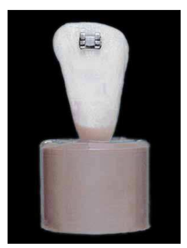
FIGURE 5 - Specimen with bracket bonded to buccal surface.

In the groups using Concise composite no light curing was performed as this is a self-curing material.