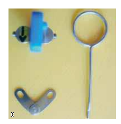
FIGURE 1 - Fan-type expansion screws used in this study. A) Morelli®. B) Dentaurum®. C) Leone®.

premolars (IP2) and intermolar (IM) widths. In addition, the maxillary arch length (AL) was measured before and after activations, as well as the height between the tip of the cusp (buccal) of the maxillary first premolars (BD1) and first molars (BD2) and the typodont base to check possible changes in the vertical dimension of these teeth. A Dentaurum<sup>®</sup> caliper with precision of 0.01 mm was used for the measurements. The complete activation sequence (13 activations) was repeated for each expansion screw (3 types) and their corresponding expansion appliances for 6 times, at a total of 18 immersions and 13 activations for each one. Data were recorded in spreadsheets for later analysis. Measurements were made at three time points: Before activations (T1), after half of the activations had been done (T2) and after activations (T3). Data were analyzed statistically. To check whether data were normally distributed, the nonparametric Kolmogorov-Smirnov test was used. Analysis of variance (ANOVA) and the Tukey test for multiple comparisons were used to compare groups to each other. The nonparametric Friedman test was used for the comparisons between activations because data were paired.