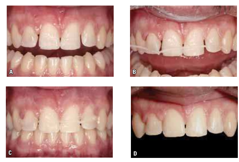
FIGURE 3 - Reopening space at the mesial of the upper lateral incisors after maxillary retainer bonding fracture ( A ). The retainer was still bonded to the upper canines and upper central incisors. A knot was made at the end of the solid thread ( B ) and this knot was bonded with composite to the labial surface of the upper left lateral incisor. The elastomeric thread was pulled and bonded to the upper right lateral incisor. The space was closed in just 10 days and the upper lateral incisors were rebonded to the upper retainer.