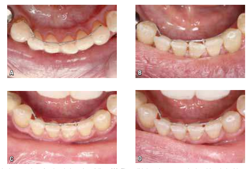
FIGURE 2 - Lower right incisor rotation after bonded retainer failure (A). The solid thread was stretched and bonded with composite just on the distal surface (B). After 10 days, a significant improvement was observed and a new thread was inserted (C). After 20 days the case was finished and the tooth was rebonded to the lower retainer (D).