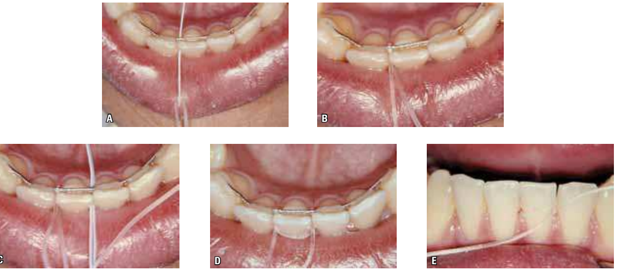
FIGURE 4 - Method used for tying the elastomeric thread when the goal is to produce lingual movement. With the aid of a floss threader, the solid thread is inserted under the retainer and the contact point of the tooth to be moved ( A ) in a buccolingual direction. The thread returns above the retainer ( B ). This procedure is repeated on the other proximal contact ( C and D ). Then, the thread is tied on the tooth labial surface ( E ). The knot can be bonded with a small amount of composite in order to facilitate its retention and to provide comfort to the patient (Video available at www.youtube.com/watch?v=sxKR3_TNIqc).