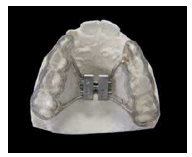
FIGURE 1 - Bonded Hyrax expander with acrylic occlusal splint used in this study.