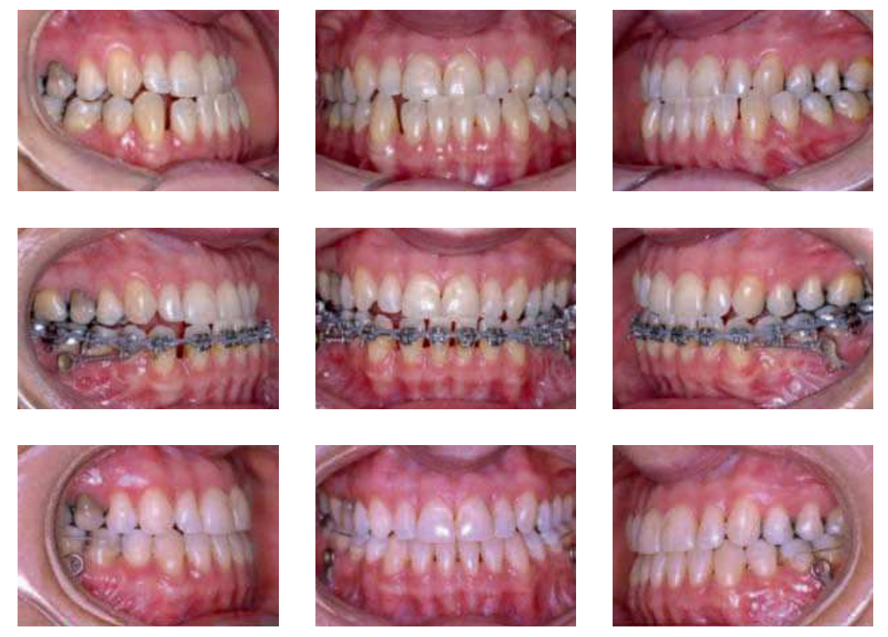
FIGURE 1 - The titanium miniplates may be used in the jaw to serve as anchors for retraction of all the lower teeth. With this, you can avoid the orthognathic surgery in patients who do not wish to submit to it. The experience with this type of treatment gave me conditions to plan the orthodontic treatment as a whole before the surgery, then, install the appliance and operate without the conventional preparation for orthognathic surgery. Avoiding the conventional preparation does not mean not preparing the case for surgery. In fact, we have with the Anticipated Benefit more involvement with the "preparation" for treatment planning.

The patient was bearer of a dentofacial deformity with a Pattern II. So, he would need lower incisor retraction prior to surgery to increase the overjet and enable mandibular advancement. During the appointment itself, I thought about my experience with Class III compensation with retraction of all lower teeth (Fig 1). In this treatment modality, we can take the lower teeth, that are already in a com-