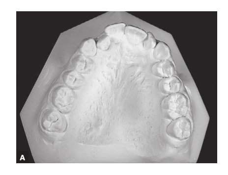
Figure 2 - A) Crowding in the upper arch in an isolated cleft palate patient. B) Crowding in the lower arch in an isolated cleft palate patient: The lower dental arch tends to accompany the upper arch, demonstrating a reduction in its transverse dimensions.