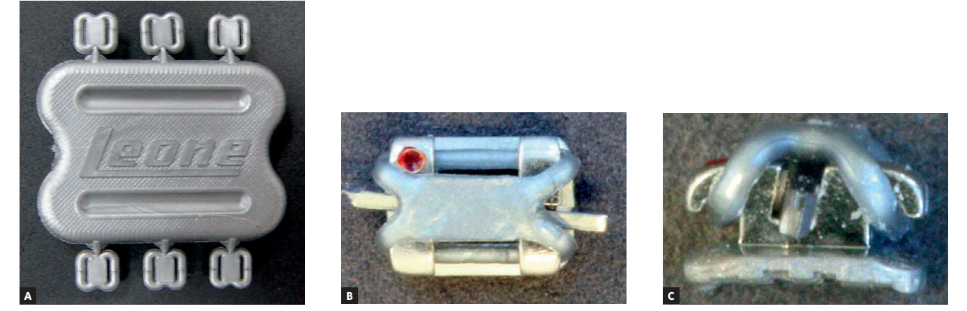
Figure 3 - A) Slide<sup>®</sup> elastic ligature, B) Frontal view of the ligature tied to a conventional metal bracket, C) Lateral view of this low-friction system, where there is no pressure on the orthodontic wire.

of the orthodontic treatment to increase efficiency in different clinical situations.