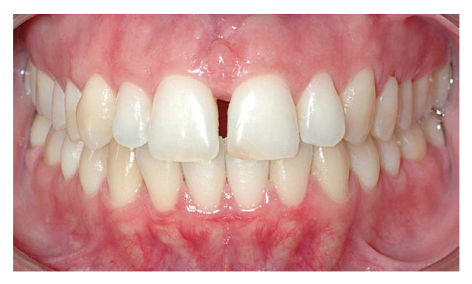
Figure 1 - Example of anterior superior diastema relapse. Photograph obtained 10 years after removing the superior Hawley retainer.

Ninety panoramic radiographs of 30 subjects (13 male and 17 female) taken at pre-treatment (T_1) , post-treatment (T_2) and post-retention (T_2) stages