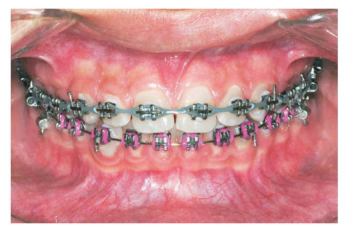
Figure 4 - Effect of crown mesialization induced by elastomeric chain.

Diastema relapse is quite often on maxillary anterior area.<sup>10,24,26,27</sup> Some authors reported that space reopening might be associated with an inappropriate root positioning at the end of treatment. However our results showed no difference between stable and unstable groups in central and lateral incisor angulations when compared in each initial, final, post-retention stages. In conclusion, this demonstrates that no association between space reopening and mesiodistal angulations was found.