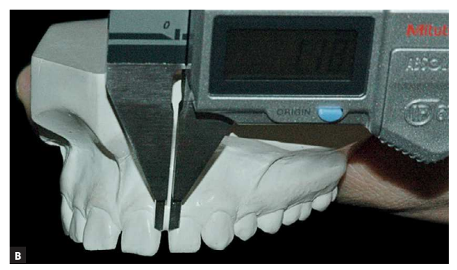
Figure 2 - A) Digital caliper Mitutoyo used to measure interincisor spacing. B) Diastema measurement method.