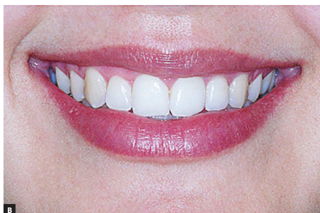
Figure 1 - Photograph cropping. A) Original photograph. B) Photograph after cropping, reducing the area to be evaluated.