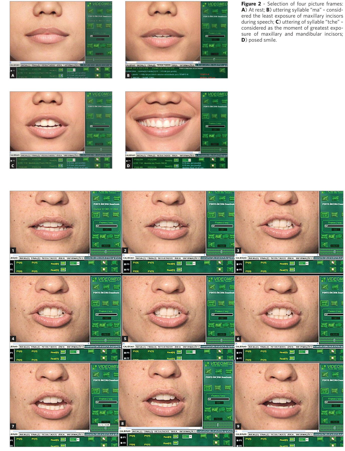
Figure 3 - Different pictures frames showing utterance of syllable "tche". Frame no. 6 best represents utterance of this phoneme.