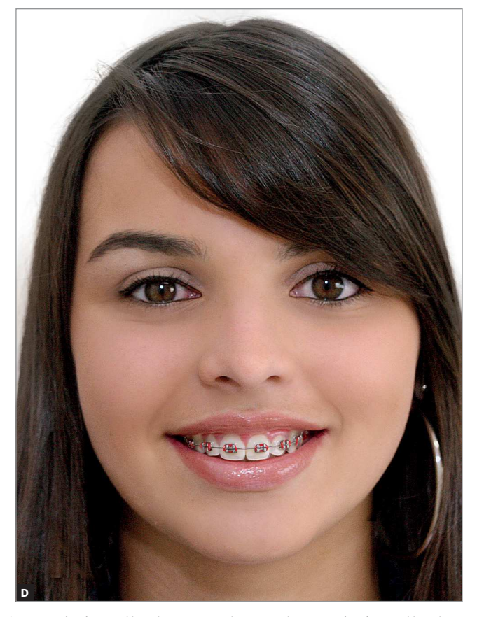
Figure 3 - A) Smile with ceramic brackets (CB). B) Metal brackets + gray ligatures (MB + GY). C) Metal brackets + green ligatures (MB + GN). D) Metal brackets + red ligatures (MB + R).