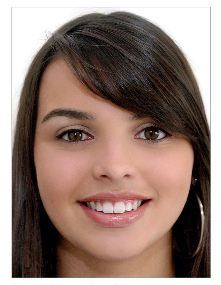
Figure 2 - Smile without brackets (NB).