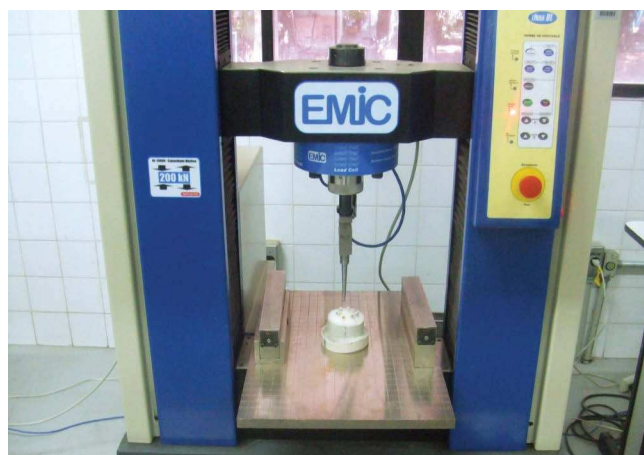
Figure 3 - Emic DL2000 universal testing machine.

The results (Table 2 and Fig 4) showed that there was a statistically significant reduction on the bond strength when compared to the Control group (19.52 kgf) and to the group where bonding was performed 24 hours after bleaching (12.31 kgf). When the bracket debonding strength was confronted with the Control group and the group where bonding was performed seven days after bleaching (18.44 kgf), it was noticed that there was no statistically significant differences.