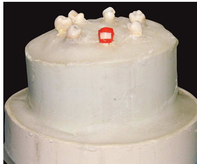
Figure 1 - Mounting the teeth with acrylic resin to the PVC bases.

Using self curing acrylic resin, each tooth was mounted in two PVC bases with different diameters, so that the buccal surface of each tooth formed a 90 degree angle with the acrylic base (Fig 1). This was necessary to standardize the traction tests in the universal testing machine.