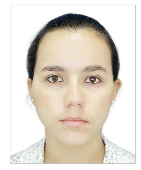
Figure 3 and 4 - Right side and frontal photograph of Pattern I patient.