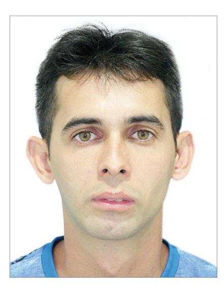
Figure 1 and 2 - Frontal and right side photograph of long face pattern patient.

The Pattern I patients<sup>7-11,13</sup> were identified by the facial normality and characterized by balanced vertical and skeletal sagittal relations on the front and profile evaluations. In frontal photograph they had apparent symmetry, proportion between the facial thirds, proportional volume of the lips vermilion and passive lip seal (Fig 3). On the evaluation of the right side photograph, Pattern I patients had mild facial convexity, expressive chin-neck line and parallel to Camper plane, and esthetically pleasant mentolabial sulcus, built with equal participation of the mentum and lower lip (Fig 4).