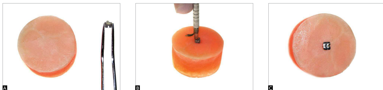
Figure 1 - Sequence of bonding, A) bonding material applied to the base of the bracket, B) pressure of 400 gF applied at the moment of bonding to standardize the material thickness, C) specimen.

Bond failure was observed by a single operator through a stereomicroscope with magnification of 40X. The Adhesive Remnant Index (ARI) was analyzed as suggested by Årtun and Bergland, 1 where 0 indicates no adhesive remnant in the dental structure; 1, less than half of remnant in the dental structure; 2, more than a half of remnant in the dental structure and 3, all the adhesive remnant adhered to the bracket base.