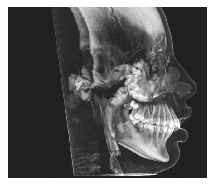
Figure 2- Total volume of the upper airways obtained by the Dolphin program. (Source: Bandeira et al.<sup>3</sup> 2013)

Bonding of orthodontic accessories directly to the enamel provided one of the greatest leaps in Orthodontics during the last decades. Today, we count on materials that present good resistance, biocompatibility and color stability. Despite all these achievements, one characteristic still lacks for an ideal bonding material: continuous release of fluoride during orthodontic treatment. Not rarely, we find, at the end of treatment, white spot lesions around the brackets.