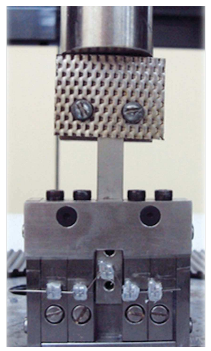
Figure 2 - Tensile strength of 6 mm being performed on the vertical bar of the experimental model, by a mechanical testing machine.

Instead of pulling the wire ends to align the maxillary crowded canine, it was preferred to elevate the mobile metallic bar from a position leveled 6 mm above. This proved to be useful to eliminate small random friction variations between the mobile and adjacent fixed metallic bars. The mobile metallic bar was elevated by the capture mechanism of the testing machine, using a 10 N load cell. This adaptation produced a mean friction value