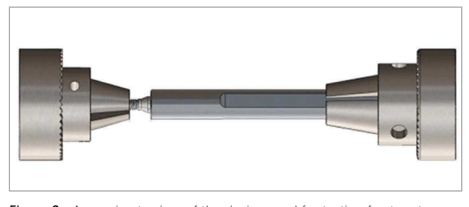
Figure 2 - Approximate view of the device used for testing fracture torque, showing one MI attached to one grip and the insertion-removal key attached to other.