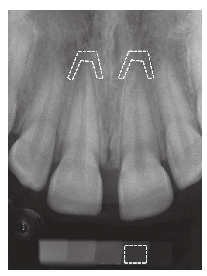
Figure 1 - Scanned periapical radiograph; region of interest selected in the apical region of upper central incisors and second step of aluminum stepwedge (evaluated by histogram tool of Adobe Photoshop CS2 program).