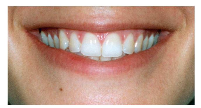
Figure 1 - Illustration of 3 photos to be evaluated in the 3 categories.