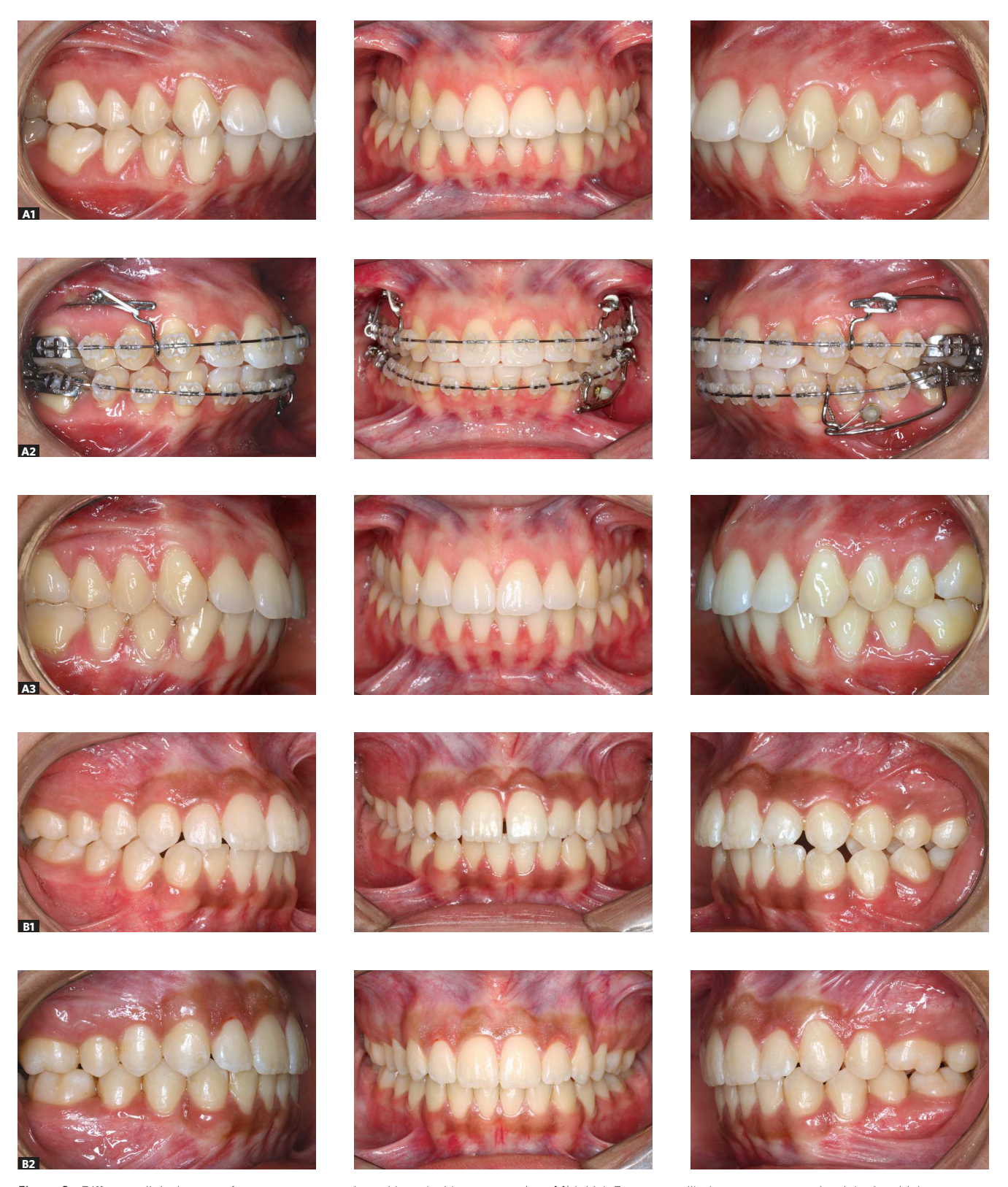
Figure 8 - Different clinical cases of asymmetry correction with and without extraction. A1) Initial: 3-mm mandibular asymmetry to the right, in which treatment plan did not include tooth extraction, A2) Intermediate: asymmetry corrected by placing a mandibular mini-implant on one side and two maxillary mini-implants, with a view to correcting dental protrusion, A3) Final: after orthodontic treatment finishing. B1) Initial: 5-mm asymmetry to the right, in which treatment plan included asymmetric extraction of left maxillary premolar, and B2) Final: after debonding of orthodontic appliance.