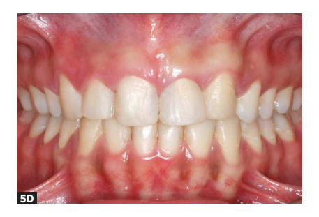
Figures 4, 5 - Different mini-implant usages. 4 - Retraction of a maxillary canine: A) initial, B) retraction of the canine performed by means of mini-implant-supported sliding jig, C) finished case. 5 - Intrusion of posterior teeth as an alternative for anterior open bite closure: A) initial, B) intermediate (note moderate open bite), C) occlusal view revealing mini-implants bucally and lingually positioned, D) final (after treatment finishing).