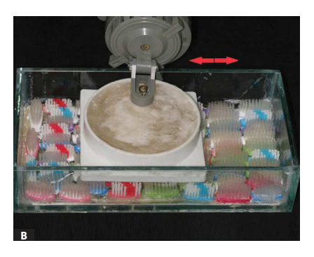
Figure 9 - A) Teeth attached to a sink strainer so as to form a single specimen to be taken to the brushing machine; B) Brushing machine comprised by a glass box with tooth brush heads attached to the bottom with hot glue. The engine of a security camera was adapted to perform round-tripping movements.