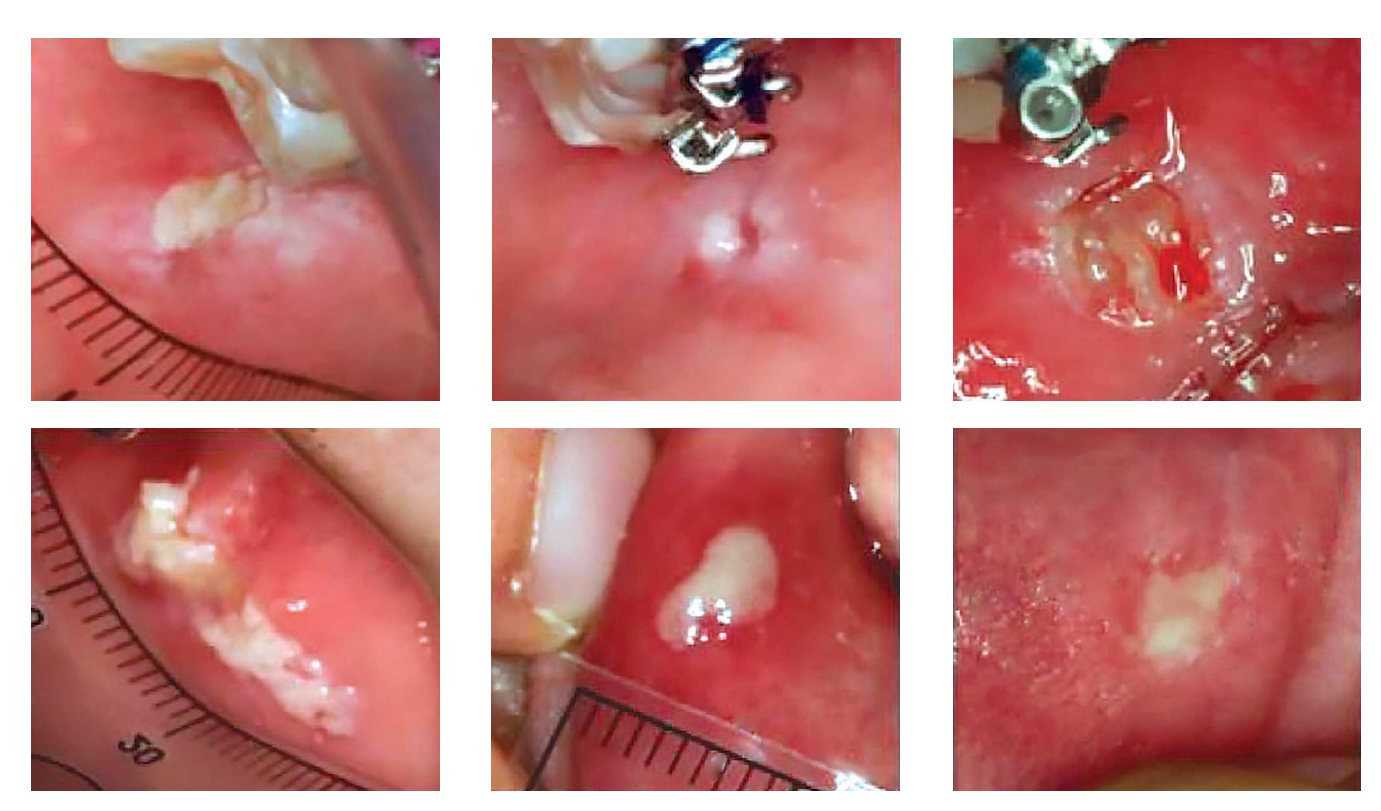
Figure 1 - Clinical presentation of ulcers from wire pokes (top panel) and injuries other than wire pokes (bottom panel) (Source: Rennick et al<sup>1</sup>, 2015).