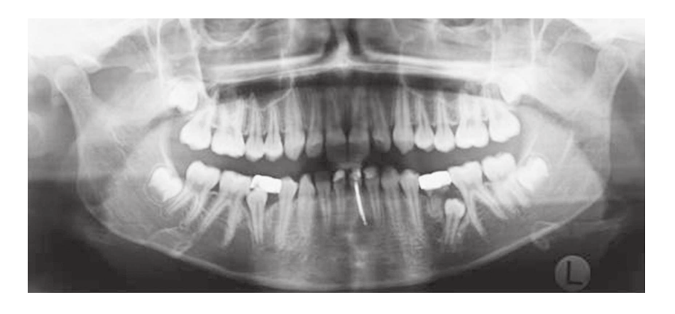
Figure 1 - Pretreatment (T_1) panoramic radiograph.