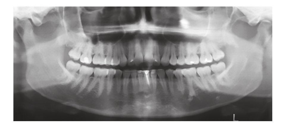
Figure 3 - Long-term post-treatment ( T_3 ) panoramic radiograph.

third molars. At T_2 , only one patient had extraction of third molars. Finally, at T_3 , only four additional patients had third molars extracted.