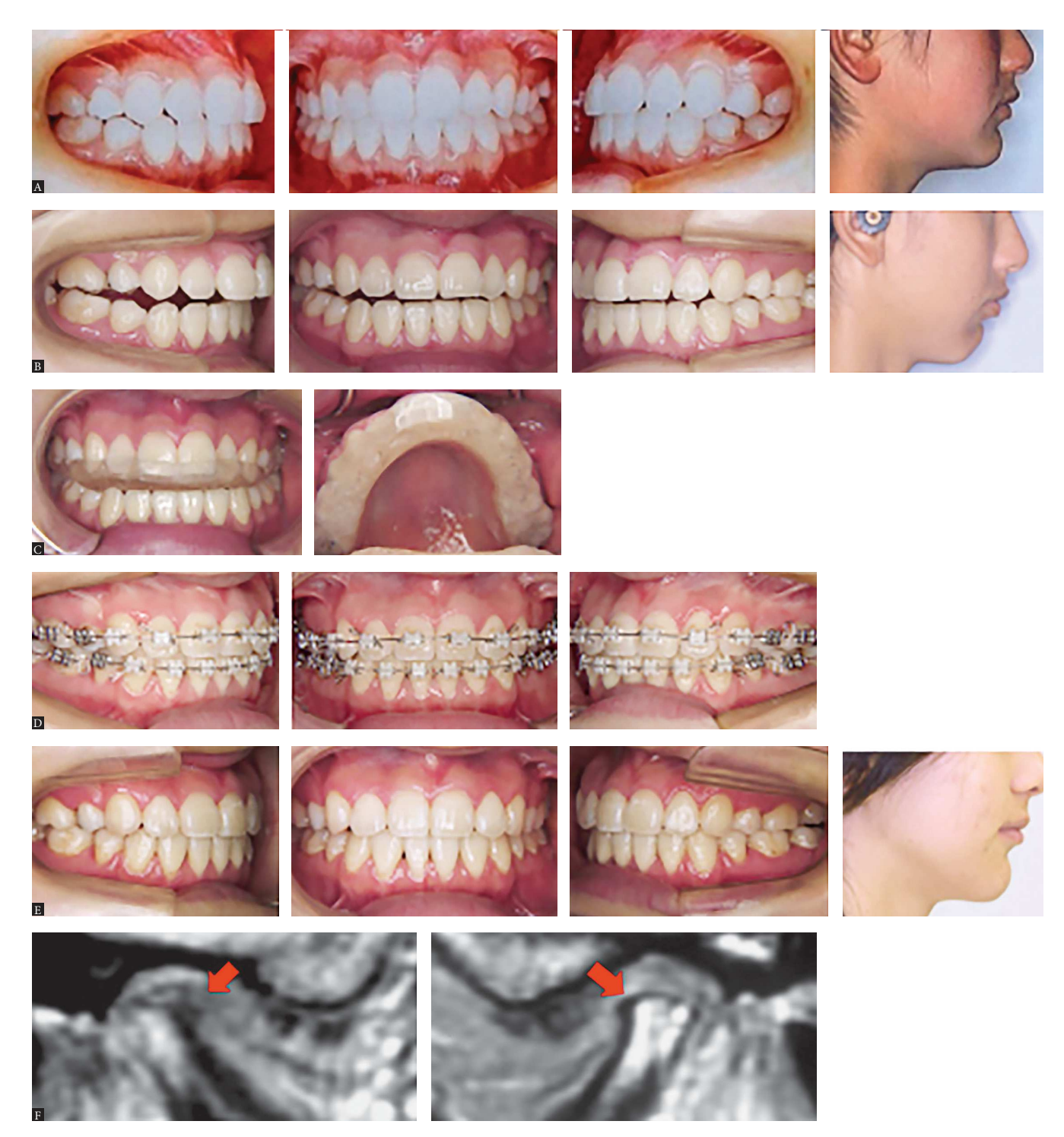
Figure 2 - A treatment case with open bite accompanied by osteoarthritis of the temporomandibular joint. A) Initiation of retention at a previous hospital. B) Initial arrival at our hospital. C) Initiation of splint therapy. D) Orthodontic treatment with multi-bracket appliances. E) Removal of all appliances. F) MRI indicated TMJ-osteoarthritis on both sides at initial arrival.