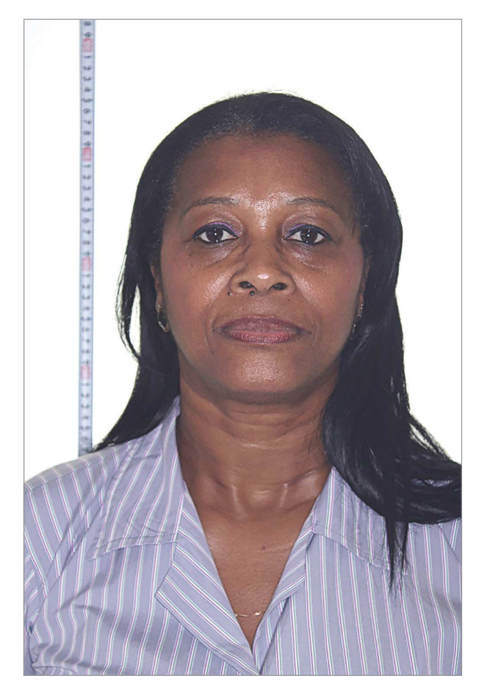
Figure 1 - Frontal view photograph from an individual of the sample.