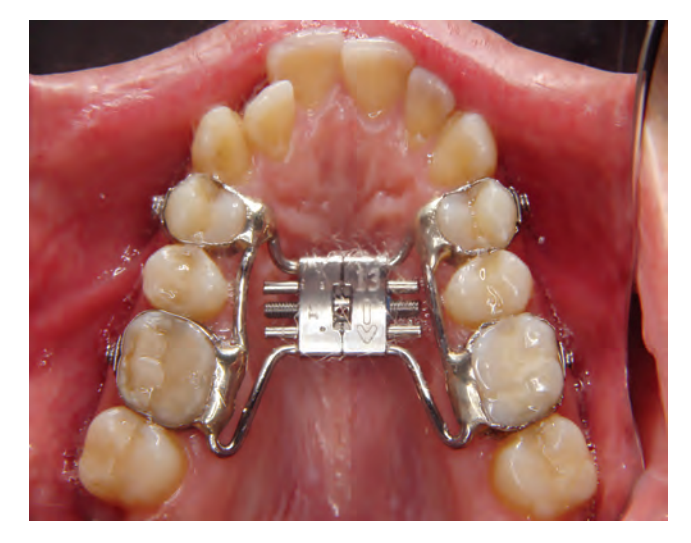
Figure 1 - Intraoral occlusal view showing the bonded expansion appliance.

» Clinical attachment level (CAL): was obtained by measuring the distance from the cemento-enamel junction (CEJ) to the gingival margin, and adding the measure of probing depth in the buccal area.