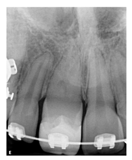
Figure 1 - A 9-year-old girl had transplanted a developing upper left second premolar to replace the traumatically lost maxillary right central incisor (A, B). The transplanted premolar was rotated during transplantation to better match the width of the neighboring central incisor. The composite build-up was made 1 year after transplantation and the orthodontic treatment was started to align teeth and establish a normal occlusion (C, D). Normal root development of the transplanted premolar and no hard tissue pathology was present on the intraoral radiograph, except for the pulp obliteration, which is a normal finding in transplanted teeth with developing roots, without a need for endodontic treatment (E).