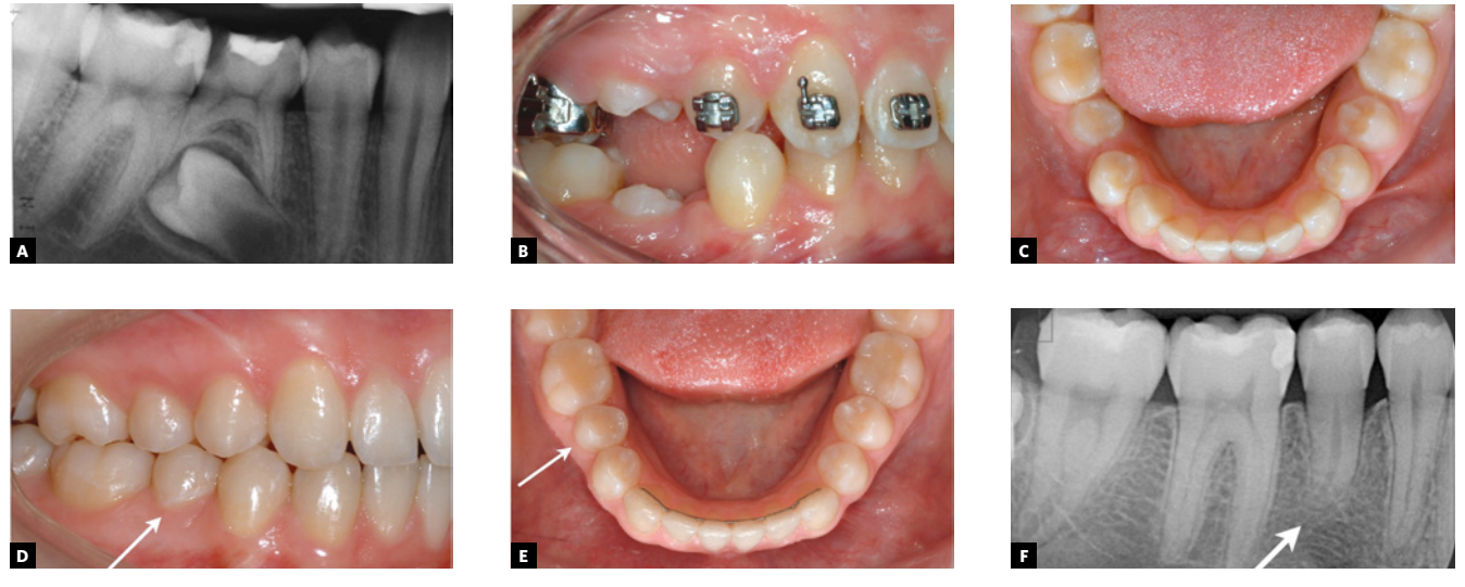
Figure 3 - The ectopic position of the developing mandibular right second premolar was present on the panoramic radiograph of a 12-years old girl, who was seeking orthodontic treatment due to malposition of her maxillary teeth and Class II malocclusion (A). The premolar was severely distally tilted and the patient and her parents were interested to perform surgical uprighting (trans-alveolar transplantation) of the affected tooth instead of orthodontic extrusion to shorten the treatment time. The transplanted tooth erupted after few weeks into an oral cavity (B, C) and an orthodontic bracket was bonded after eruption into contacts with the opposing premolars. Normal occlusion was established after orthodontic treatment including the transplanted premolar (D, E; arrow). The root of the transplanted premolar continued development after surgery (arrow), but remained somehow shorter than normal (F). Pulp obliteration and normal hard periodontal tissues are also present on the radiograph.

Spot ankylosis is practically impossible to detect on radiographs, and the best way to confirm it is by applying orthodontic traction to the suspected transplant. If the transplant does not respond to orthodontic forces, while neighboring teeth are moving, then the ankylosis is confirmed.