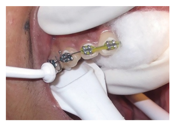
Figure 2 - Ozone irrigation in split-mouth format.

The gold standard for treatment of Class II malocclusions with maxillary excess is the use of extraoral appliances. External forces promote a redirection in bone growth by correcting these malocclusions. When applying orthopedic forces, it is necessary to use high magnitude forces in order to achieve orthopedic effect with little or no dental effect. However it is utopian to think that the teeth will not move when orthopedic forces are applied. Based on this assumption, studies have been carried out aiming to evaluate which are the dental movements after application of orthopedic force. Recently, a study<sup>5</sup> was conducted at the University of Tromso in which the canine eruption pathway was evaluated in patients using an extraoral appliance in arches with and without space. The results obtained with this study revealed that the treatment with an extraoral appliance in Angle Class II malocclusion in children affects the eruption of maxillary canines, leaving them to a more vertical direction. The authors point out that this change seems to be related to space conditions in the maxillary arch, especially in the intercanine region, with a greater effect in children with dental arches with space left over than in the presence of crowding.