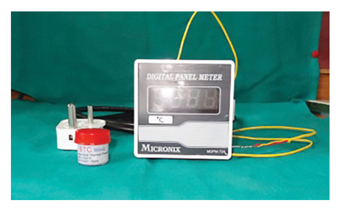
Figure 1 \, - J-type thermocouple connected to digital thermometer and silicon heat transfer material.

od assigned. Both proximal surfaces were stripped 0.5 mm each, as measured using vernier calipers. The temperature was recorded again after the stripping procedure. Temperatures produced before and after