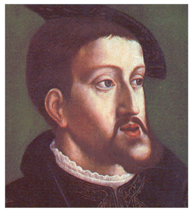
Figure 1 - Profile view of Carlos V of Spain and Germany at 17 years of age. His family included 13 lineages of European royalty and 409 documented individuals,<sup>33</sup> with 321 with mandibular prognathism varying from mild to severe. Analyses of this family suggested that mandibular prognathism has an autosomal dominant mode of inheritance, and cases that did not fit well may be due to consanguinity. In some cases, the prognathism escaped a generation and penetrance was estimated at 0.88.

The suggestion that malocclusion has a genetic component comes from observations of mandibular prognathism (frequently associated with Angle's Class III) segregating in families. Probably the best-known example is the House of Habsburg, which produced emperors and kings of Bohemia (current Czech Republic), England, Germany, Hungary, Croatia, Illyria (a region of Austria), the Mexican second empire, Ireland, Portugal, Spain, and several administrators and principalities of Denmark and Italy (Fig 1).<sup>3</sup> Since many cases of mandibular prognathism aggregate in families, there is the perception that it follows an autosomal dominant Mendelian mode of inheritance (monogenic or single gene). The perception that one gene with a main effect leads to mandibular prognathism<sup>4</sup> motivated linkage<sup>5-8</sup> and association<sup>9-17</sup> studies under the hypothesis that a strong genetic effect can be identified even with relatively small sample sizes (definitions of linkage and association studies are provided at the end of this article). These results are inconsistent, suggesting that monogenic inheritance and a gene with a major effect