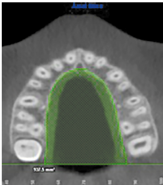
Figure 1 - Surface of the palate area (PA).

Based on the sample calculation, this sample with 14 patients, presenting a standard deviation of 3.66, a difference to be detected of 2.7 mm, a significance level of 5% and a two-tailed hypothesis test, has a power of 80%.