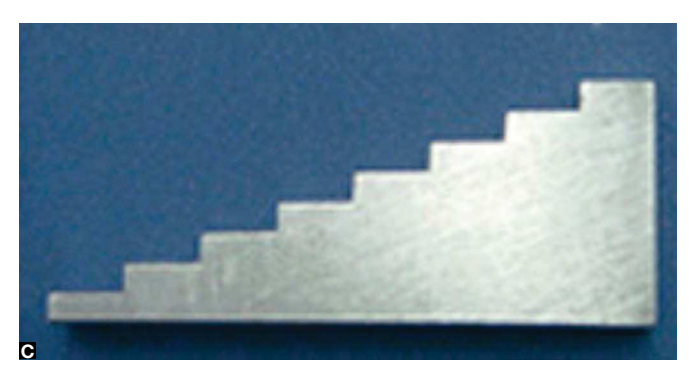
Figure 2. A) X-ray machine positioned, radiographic film, lead plate and step wedge on the Styrofoam; B) Detail of lead and step wedge on the radiographic film; C) Aluminum step wedge.

unbranded portable dark chamber). Then thet were compared to the control group, taking into account each type of film used (Table 1). There was a statistically significant difference between the portable dark chamber Unemol® and the control one, when using the Kodak DF-58 and Agfa Dentus M2 films, which did not happen when using the Kodak Espeed and IP 21 Insight. For the brand VH<sup>®</sup>, there was a statistically significant difference in the control group when using all films except the IP 21 Insight film. For MPG<sup>®</sup> and unbranded portable dark chamber, there was a statistically significant difference in the control group when using all films.