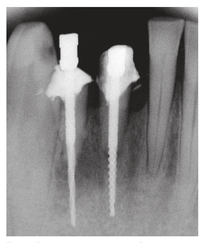
Figure 2. Postoperative periapical radiograph. Observe intraosseous endodontic implants.