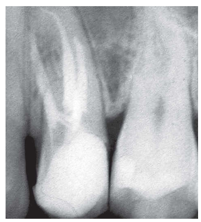
Figure 5. Radiographic control of endodontic treatment after 2 years, with appearance of normality.

The intracanal medication has the function of eliminate remaining microorganisms and prevent recontamination, prevent or reduce periapical inflammation, solubilize organic matter, neutralize toxins, control persistent exudation, control external inflammatory resorption and stimulate repair. Calcium hydroxide is the most appropriate medication for endodontic purposes, being a substance with antimicrobial activity, inhibiting root resorption and inducing formation of hard tissue. However it is necessary a long time in contact with the tissue so that its action is successful, 5-9.13,17 which justified the permanence of calcium hydroxide inside the canals for a month in this case presented.