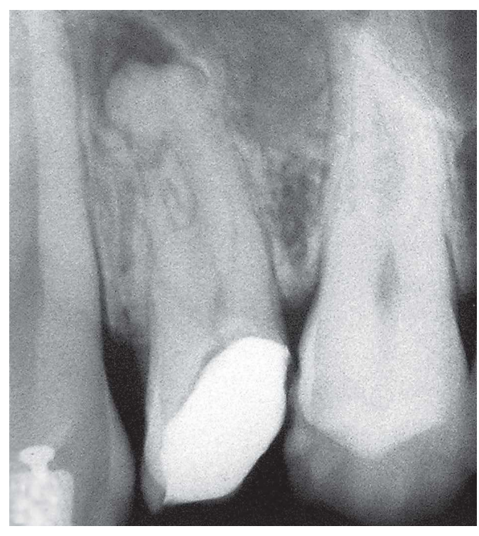
Figure 1. Initial radiographic examination of tooth #14, suggesting trirradicular premolar.

Radiographically, it was observed unusual root anatomy, suggestive of two buccal roots and one palatal root (Fig 1). After performing anesthesia, access cavities and rubber dam, it was confirmed the presence of two vestibular sockets, making the final shape triangular, with a base facing the buccal aspect (Fig 2). The exploration of the canals was performed with #10 K-file and the root canal length was measured