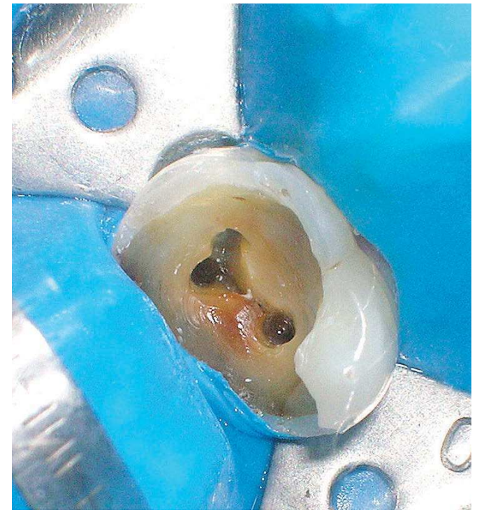
Figure 2. Triangular shape and presence of three roots.