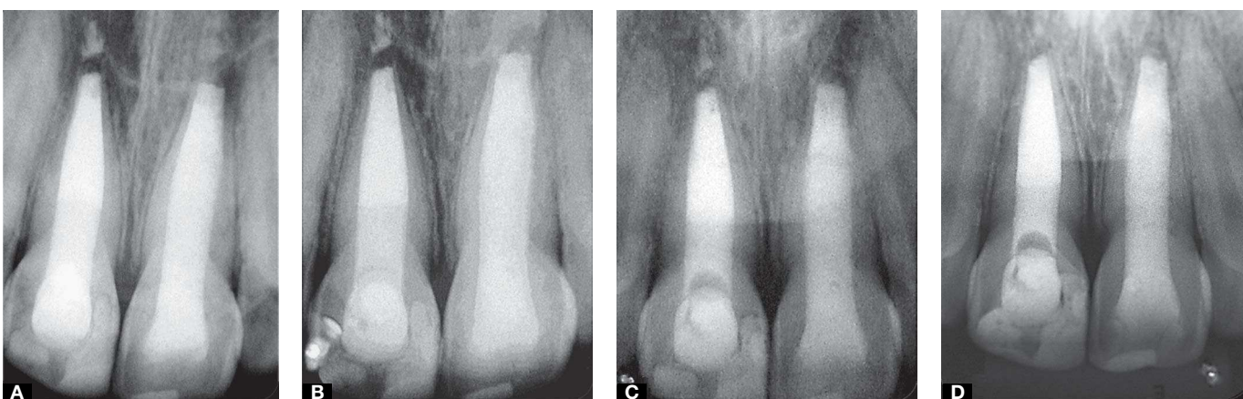
Figure 4. A) 6-month follow-up. B) 12-month follow-up. C) 4-year follow-up. D) 5-year follow-up.

Immature teeth with pulp necrosis require treatments which minimize anatomical difficulties presented by these teeth. Some of these treatments include apexification with periodic changes of intracanal medicament, apexification with MTA apical plug and, recently, pulp revascularization.<sup>14,15</sup> Two of these options were employed in the present case, which proved to be efficient to repair the periapical region and stimulate apical closure.