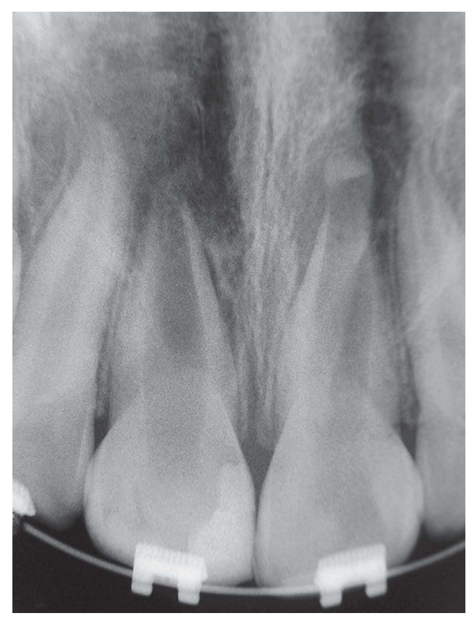
Figure 1. Initial periapical radiograph revealing immature teeth and periapical lesions associated to right and left central incisors.

As for obturation of the middle and cervical thirds. coltosol (Coltene/Whaledent<sup>™</sup>, New Jersey, USA) increments were inserted, followed by fixed coronary restoration with composite resin (Filtek 3M Espe<sup>™</sup>, Sumaré, Brazil) (Fig 3). After a seven-month followup, radiographic examination revealed deposition of mineralized tissue in the apical region of the incisors, confirming the occurrence of apexification. In addition, reduction in periapical radiolucency and absence of root resorption (Fig. 4). After eight months, the obturation paste of the right central incisor was removed, and the tooth was filled with gutta-percha and Endomethasone cement (Septodont<sup>™</sup>, Paris, France). The left incisor remained with the MTA apical plug and obturation. After five years, the teeth presented neither symptomatology, nor root resorption, proving apexification therapy to be successful when performed with different techniques at the same patient, suggesting that both treatments may be equally efficient.