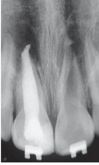
Figure 2. Obturation paste manipulated with calcium hydroxide, 2% chlorhexidine gel and zinc oxide in the proportion of 2:1:2. Radiographic exam after insertion of obturation paste.