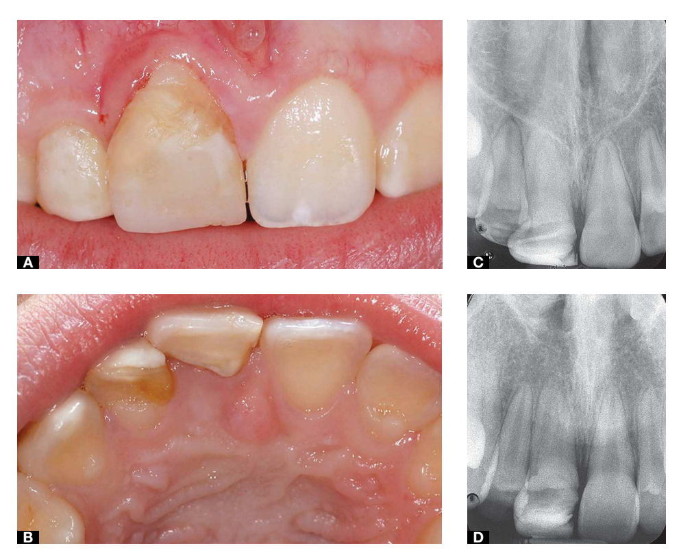
Figure 1. Preoperative photographs: A) labial view. B) occlusal view. C) Preoperative radiograph revealing irregular morphology of tooth 11. D) Off-angle angulations.