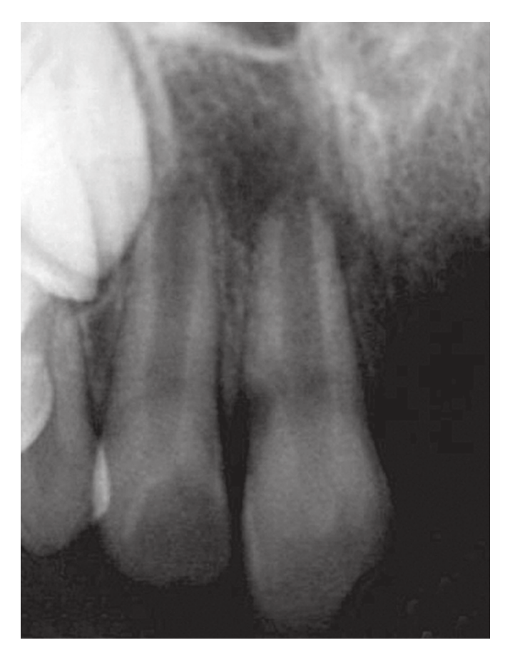
Figure 1. Initial radiograph after retainer removal.

The patient returned for clinical follow-up every three months, since radiographic examination revealed the presence of intracanal dressing completely filling the root canal. After nine months of treatment, there was an apical barrier on tooth #11 and partial periapical lesion remission (Fig 3A). After two years, the intracanal dressing remained filling the root canal with no need of replacement. Apical barrier and periapical lesion remission were then identified (Fig 3B).