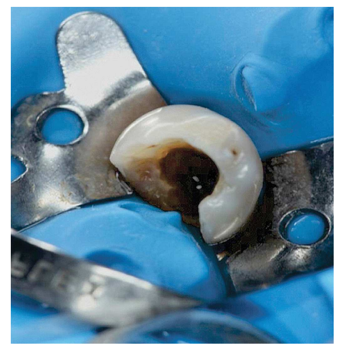
Figure 6. Absolute isolation with OptiDam<sup>®</sup> pushed through the gingival sulcus.

Slaus and Bottenberg<sup>5</sup> report that 77.3% of a sample comprising Belgium dentists never use rubber dam, whereas 59% of American practitioners use it. As for dentists in the United Kingdom, 60 to 70% of them report never using any kind of isolation procedure. This fact might be explained by several reasons, namely: potential waste of time, patient's pain, extra costs, frustration, anger, lack of experience, habit and lack of confidence.<sup>4</sup>