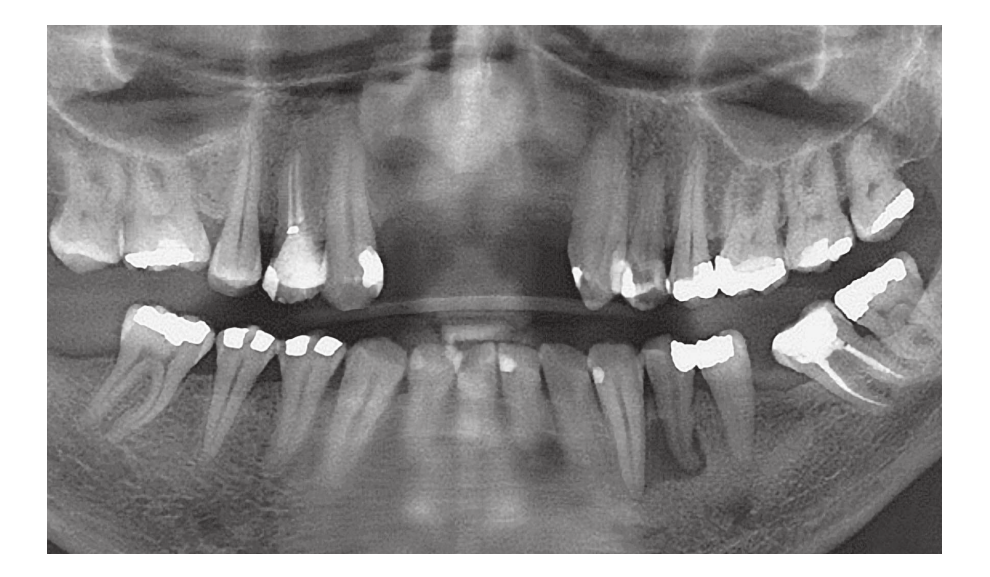
Figure 1. Panoramic radiograph imaging.

A 41-year-old male patient attended the Dental Clinics at UNIPAR. He had no symptoms and was referred to the Supervised Internship in Multidisciplinary Clinics II. Treatment planning was based on data collected during the first interview as well as from clinical examination and panoramic radiograph revealing the presence of a radiolucent area with unclear contour associated with the apex of the left lower first premolar (#34) (Fig 1). Clinical examination revealed amalgam restoration on the occlusal and distal surfaces of #34 without biological width invasion. The tooth tested negative at vertical percussion and cold testing. Based on signs and symptoms, clinicians arrived at a diagnosis of pulp necrosis and, for this reason, recommended endodontic treatment. They opted to use Optidam<sup>®</sup> posterior for absolute isolation of the operating field (Fig 2).