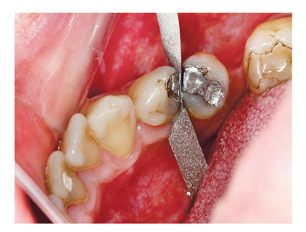
Figure 3. Steel file used through interdental spaces to favor rubber dam placement.

The operating field was previously prepared with a steel file used through interdental spaces to favor rubber dam placement (Fig 3).