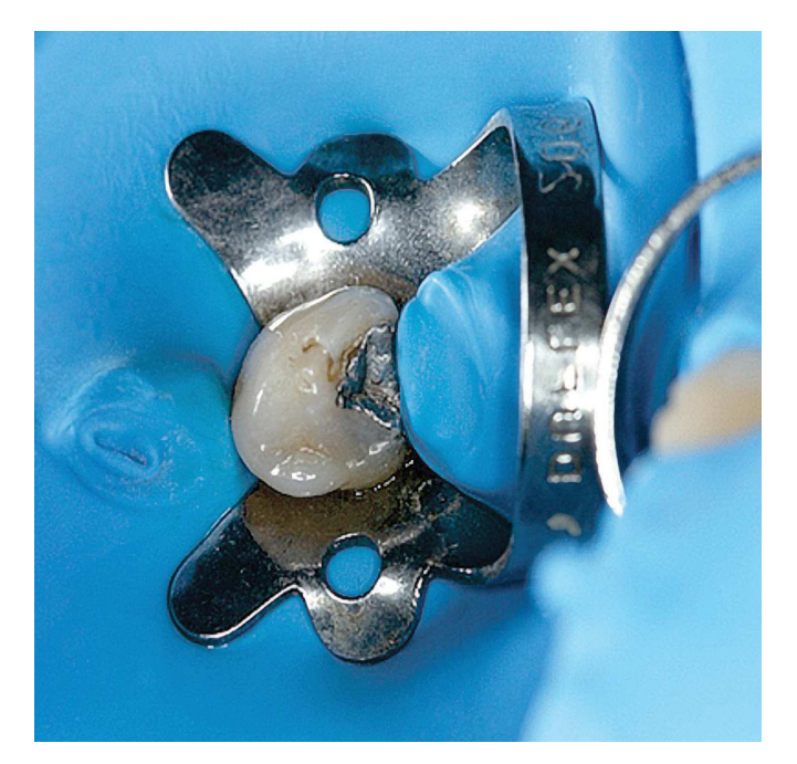
Figure 5. Absolute isolation with OptiDam®.