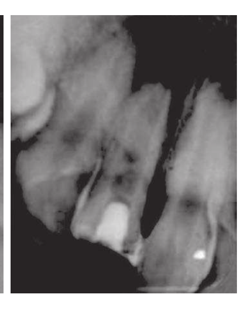
Figure 3. Root canal filled with HPG.