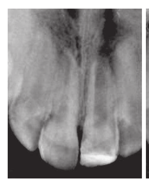
Figure 1. Initial radiograph.